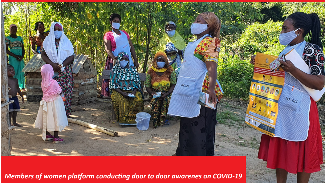
Members of women platform conducting door to door awareness on COVID-19