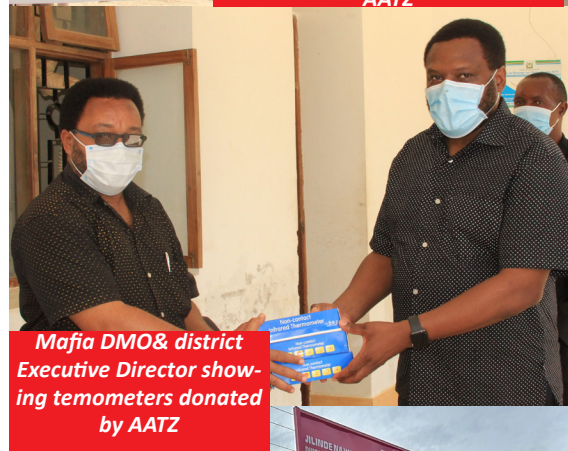
Mafia DMO & district Executive Director showing thermometers donated by AATZ