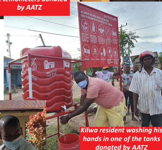
Kilwa resident washing his hands in one of the tanks donated by AATZ