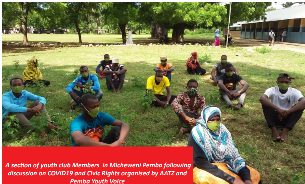
A section of youth club Members in Micheweni Pemba following discussion on COVID19 and Civic Rights organised by AATZ and Pemba Youth Voice

We must acknowledge that COVID-19 has also increased women's unpaid labor and women are already relegated to the informal sector and when we talk about helping women recover their business, one demand