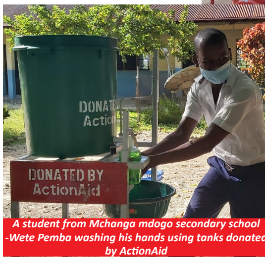
A student from Mchanga mdogo secondary school -Wete Pemba washing his hands using tanks donated by ActionAid