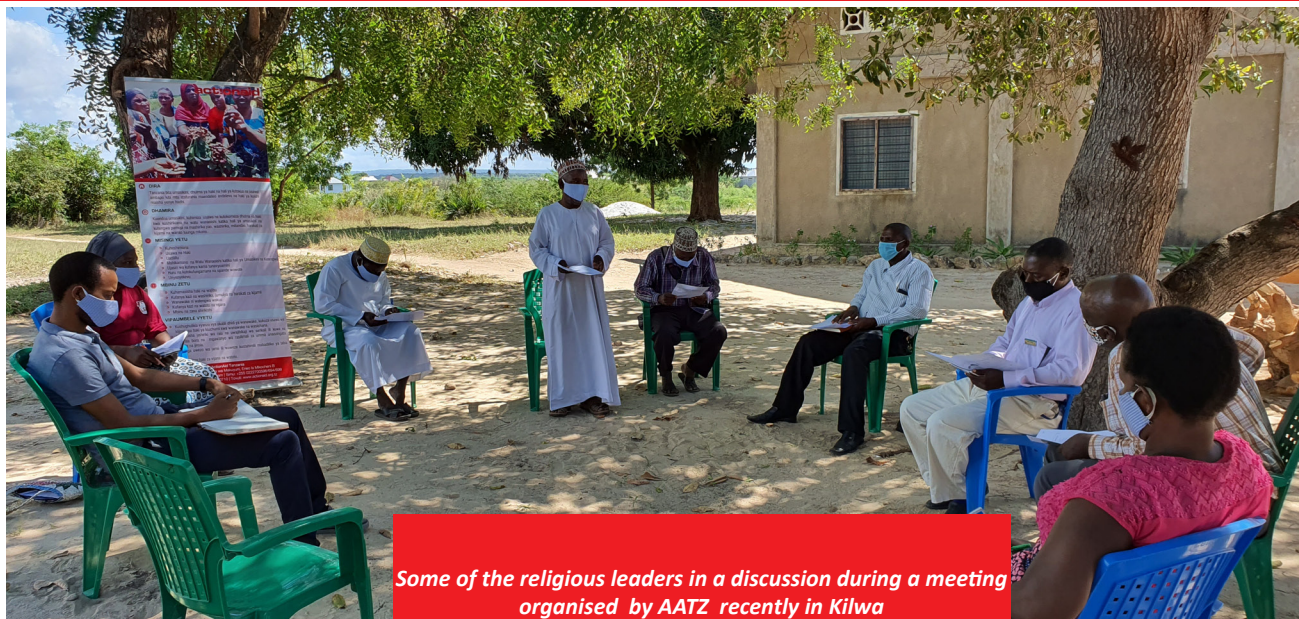
Some of the religious leaders in a discussion during a meeting organised by AATZ recently in Kilwa

leaders in this district, we will relay the same message to the faithful so that they take care. I will also spread the teaching to all leaders at various mosques in the district, to help fight this war” he said.