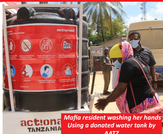
Mafia resident washing her hands Using a donated water tank by AATZ

"I would thank AATZ for the water tanks because they will help to increase the frequency people wash their hands. And on the other hand, the thermometers are a good development, because people were not having their temperatures taken at important areas such as the airport and port.," she said.