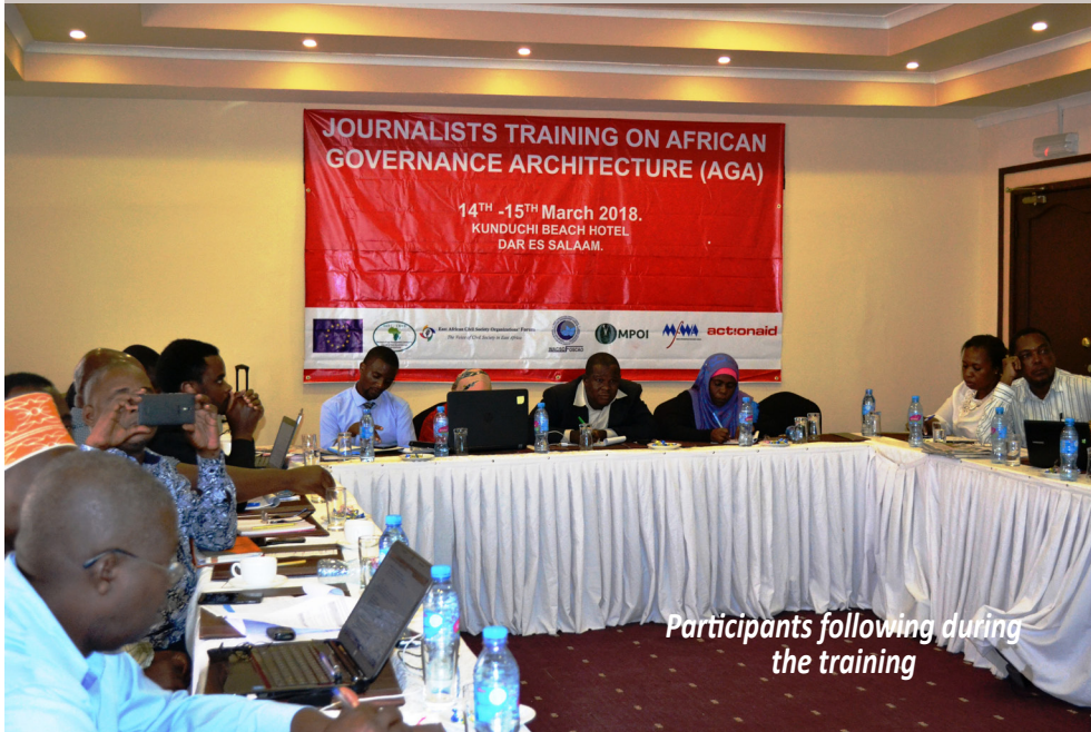
Participants following during the training

participants who committed to start including the AU in their news diaries. This was because through the trainings, they have realized that there are a lot of issues they could write about AGA.