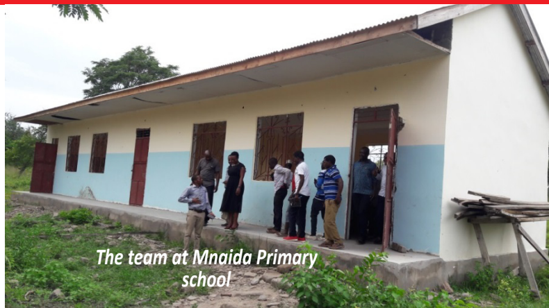
The team at Mnaida Primary school

Other Local Rights Program partners that has been working with ActionAid in the locality is Tandahimba Women's Rights Organization (TAWORO), Newala Women's Rights Organization (NEWORA), Asasi ya Wanaoishi na Virusi vya Ukimwi Tandahimba (AWAVIUTA), Tandahimba Education Organization (TANEO), Newala Farmers Association (NEFA), Tandahimba NGO Network (TANGONET), Newala Education Development Association (NEDA), Tandahimba Youth Education and Development Organization (TAYEDO), Mtandao wa waishio na virusi vya Ukimwi Newala (MWAVINE) and Newala NGO Network (NEW-NGONET).