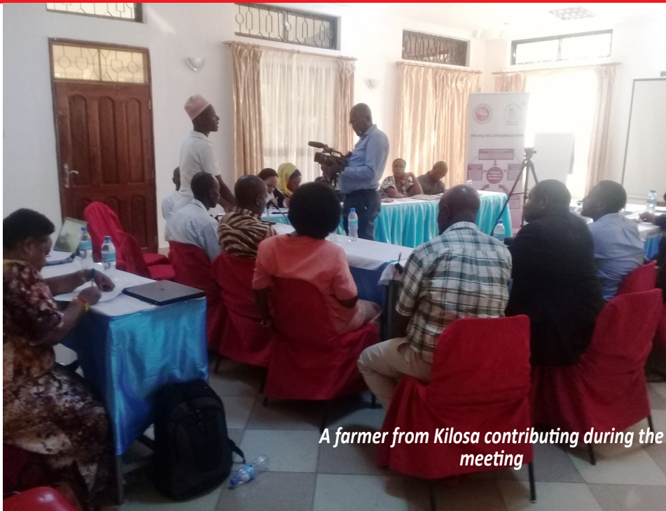
A farmer from Kilosa contributing during the meeting