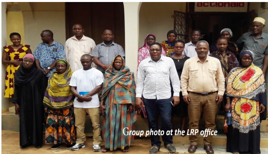
Group photo at the LRP office