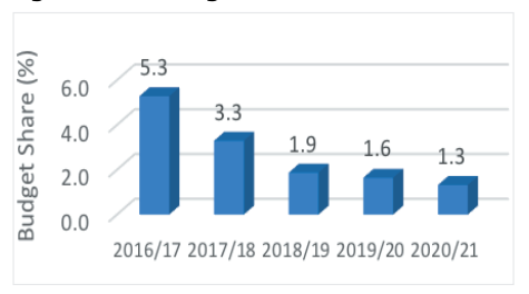
Figure 1: Five Years Trend of the National Agriculture Budget Share

Source: Ministry of Finance and Planning (MoF)P,