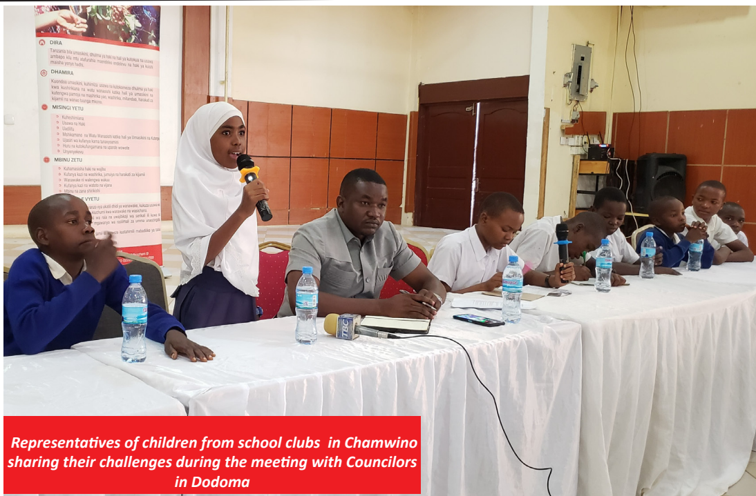
Representatives of children from school clubs in Chamwino sharing their challenges during the meeting with Councilors in Dodoma

friendly learning environment for children with disability, shortage of desks, classrooms, and teachers, etc.