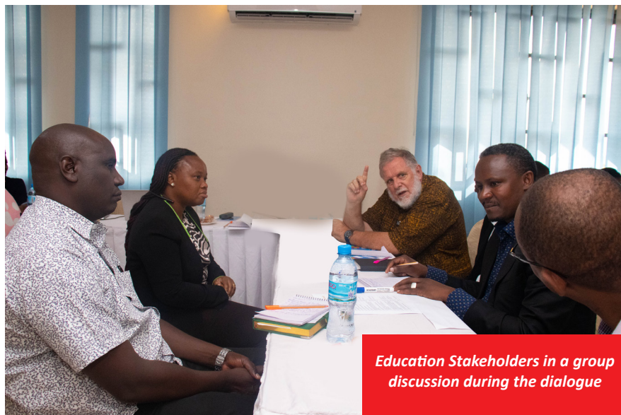
Education Stakeholders in a group discussion during the dialogue