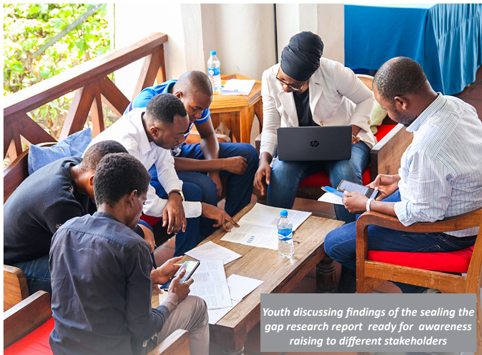
Youth discussing findings of the sealing the gap research report ready for awareness raising to different stakeholders