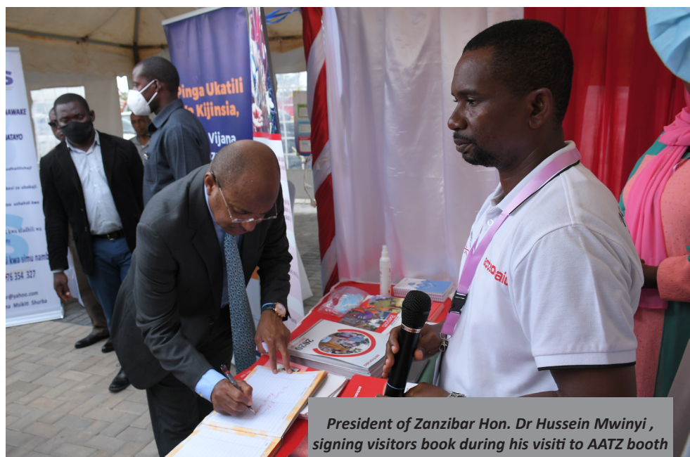
President of Zanzibar Hon. Dr. Hussein Mwinyi, signing visitors book during his visit to AATZ booth

They recommended that ZANGOF should be sustained to strengthen the relationship between CSOs and the Government and CSOs to continue advocating for the revision of outdated policies.