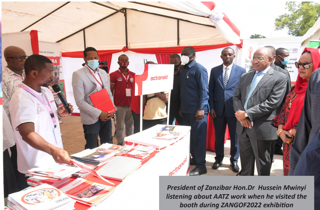
President of Zanzibar Hon. Dr. Hussein Mwinyi listening about AATZ work when he visited the booth during ZANGOF2022 exhibition

A ctionAid Tanzania (AATZ) joined other stakeholders in a two-day event titled “Zanzibar NGOs forum” (ZANGOF 2022) which took place at Golden Tulip Hotel in Zanzibar from 12th to 14th March 2022.