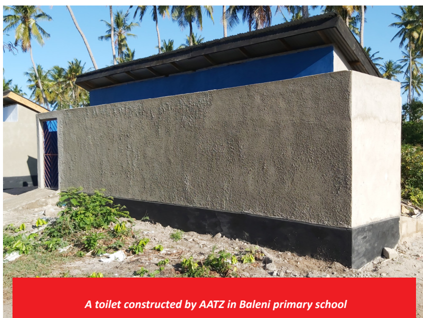
A toilet constructed by AATZ in Baleni primary school