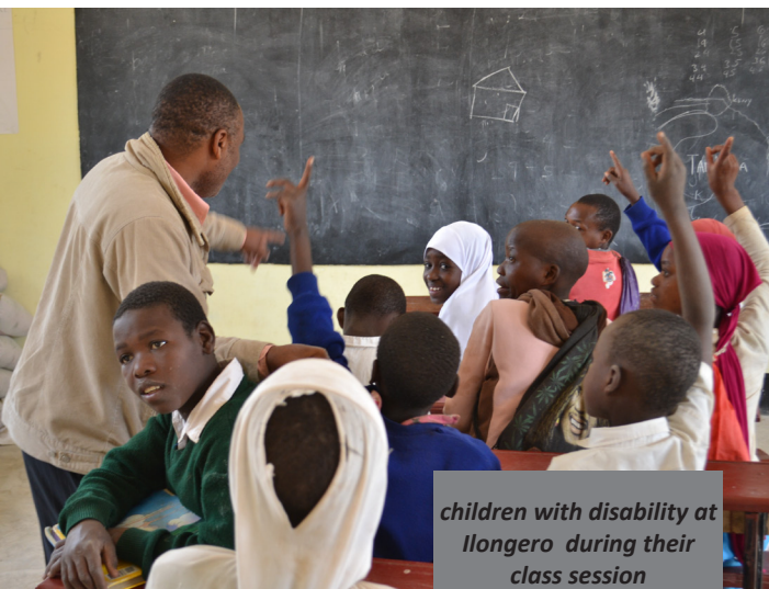
children with disability at Ilongero during their class session

Action Aid Tanzania through Breaking Barriers and tax justice projects has been advocating to see governments take action to increase the SHARE of funds allocated to and spent on free, quality, inclusive public education.