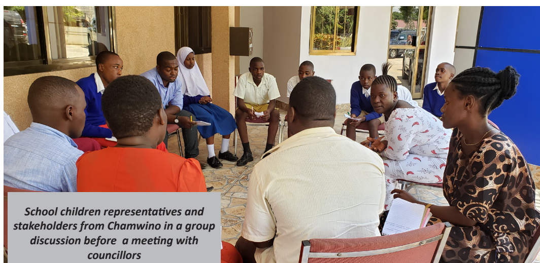
School children representatives and stakeholders from Chamwino in a group discussion before a meeting with councillors

The activity was part of the Breaking Barriers: Tax Justice & Gender Responsive Public Services Project which was being implemented by ActionAid Tanzania from July 2018. It is a multi-country project which is under implementation in Malawi, Mozambique, Nigeria, and Tanzania. It is funded by Norwegian Agency for Development Cooperation-NORAD