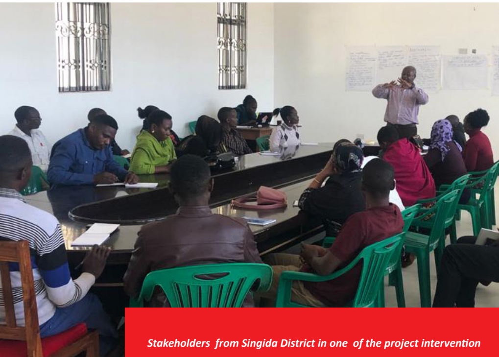
Stakeholders from Singida District in one of the project intervention

S takeholders in Singida District have commended ActionAid Tanzania (AATZ) for its significant contribution in improving education in the districts.