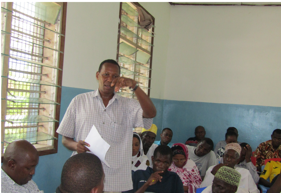
District Community Development officer contributing during “Shule ni choo” reflection meeting

As the initiatives of the campaign continues, it resulted to the construction of toilets in 5 schools which were; Kilimahewa, Kanga, Ndagoni, Kipingwi primary School and Gonge which helped to reduce the problem by 70%.