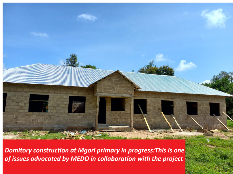
Dormitory construction at Mgori primary in progress: This is one of issues advocated by MEDO in collaboration with the project